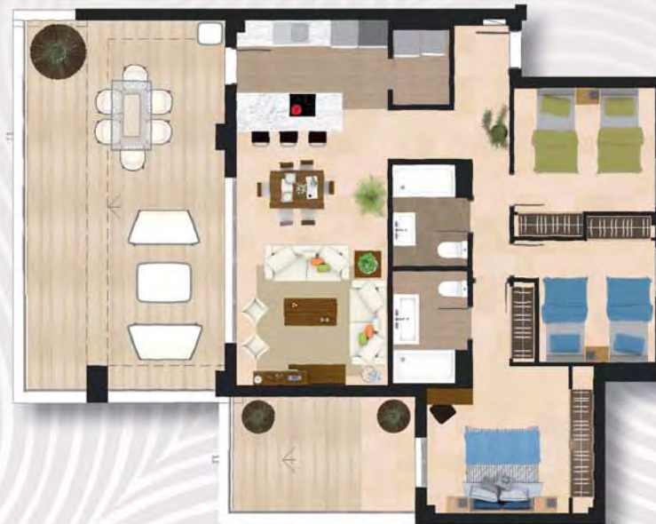
APARTMENT 3 BEDS