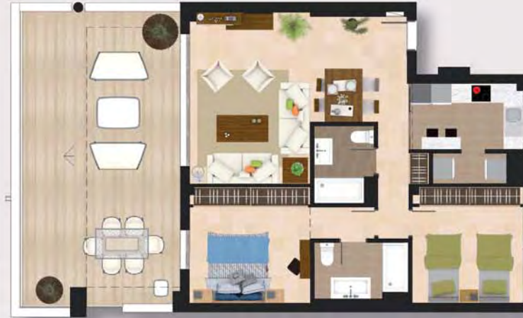
APARTMENT 2 BEDS