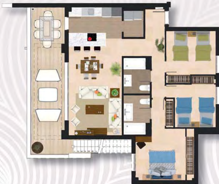
DUPLEX 3 BEDS WITH SOLARIUM